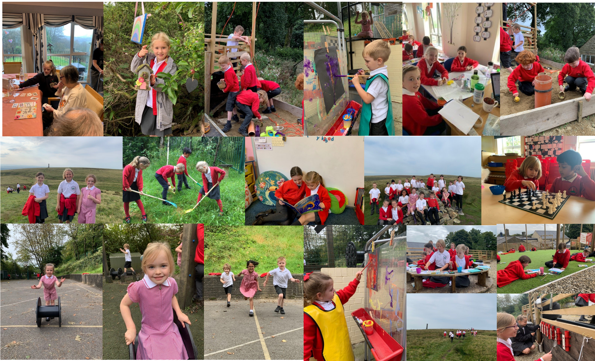
Emmanuel Holcombe Primary School, Holcombe village, Ramsbottom, BL8 4PA